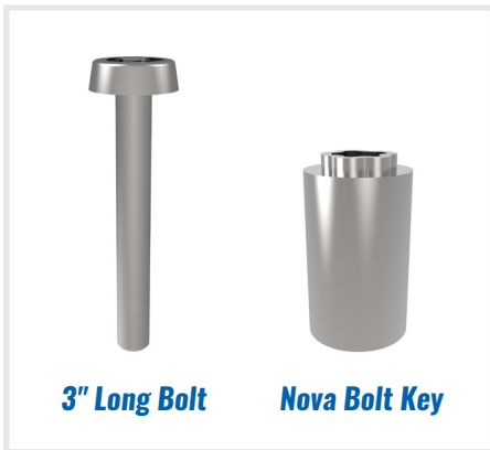
3" Long Bolt